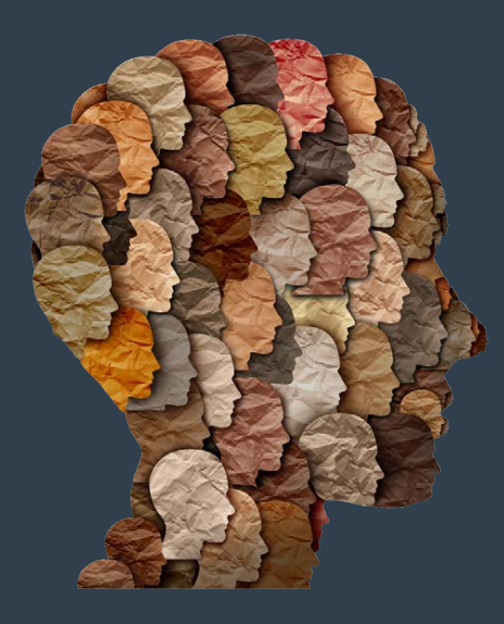
Science is strengthened by the open exchange of diverse perspectives and ideas