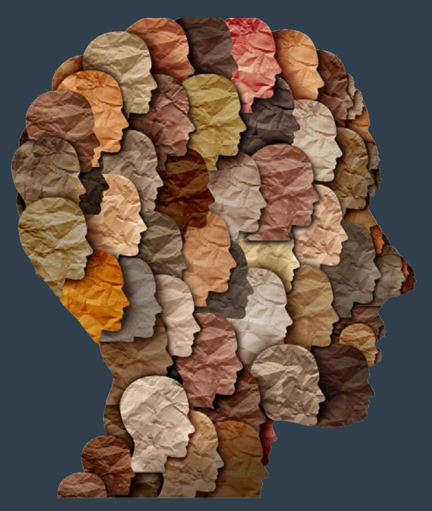
Science is strengthened by the open exchange of diverse perspectives and ideas