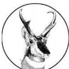
American Society of Mammalogists